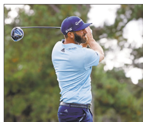
Dustin Johnson tees off on the third tee during a practice round Monday, Nov. 9, at Augusta National Golf Club.

PointsBet also listed Woods at +750 to finish in the top 5, +320 to finish in the top 10 and +130