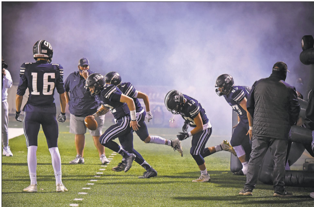
The Lumberjacks run onto the field ahead of Friday's game against Alexandria at Chet Anderson Stadium.

Not to be forgotten, however, is that a rivalry trophy — and the accompanying bragging rights — are also at stake. The Axe, which is still less than a decade old, has been in the Lumberjacks' possession just once. That came thanks to a 2018 regular season win, the program's first victory over the Spuds since 2012, but possession