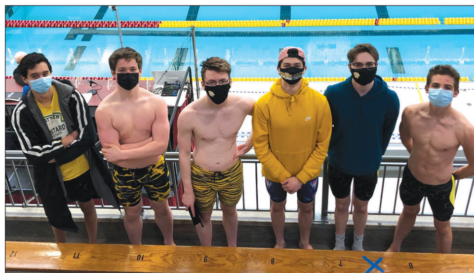
Fridley had entrants in four events in the State Boys Swimming and Diving Championships March 18-20, earning 24th in Class A.