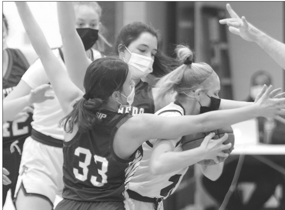
Spring Lake Park's defense was too much for Mounds View to overcome in the Section 5AAAA quarterfinals March 20, with the Panthers rolling to a 71-28 win. Spring Lake Park followed with a 71-58 win at Roseville in the semifinals March 23, earning a spot in the finals against Centennial. View more photos from the week's section basketball action online at abcnewspapers.com/sports .

Burton scored 20 for the fifth-ranked Hylanders.