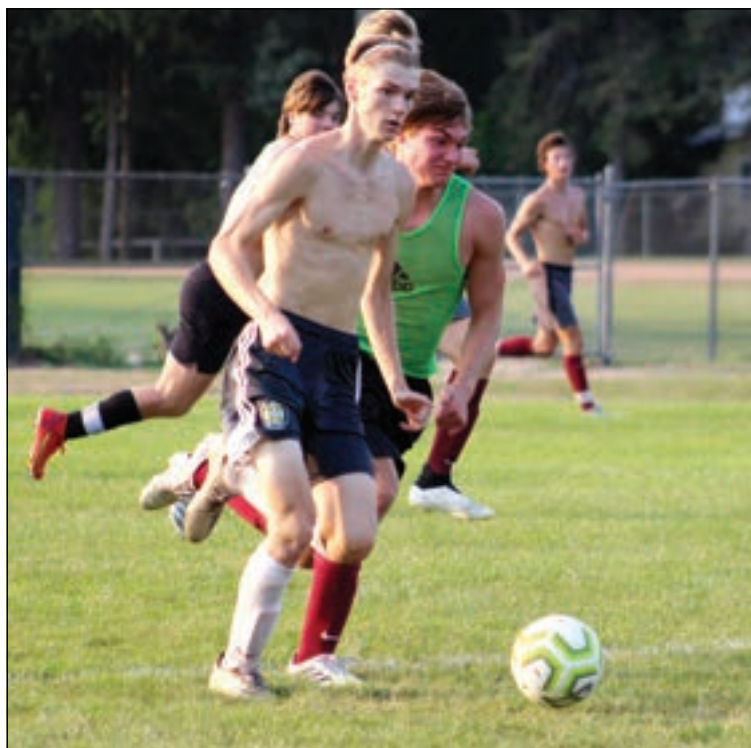
The Forest Lake boys soccer team will focus on ball control and sound defense as it looks to post a winning season.