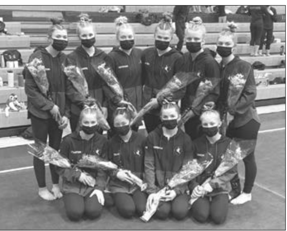
The Stillwater gymnastics team celebrates their Section 4AA championship on Saturday, March 20 at White Bear Lake High School.

floor so we did keep our a month. score up, but we did leave