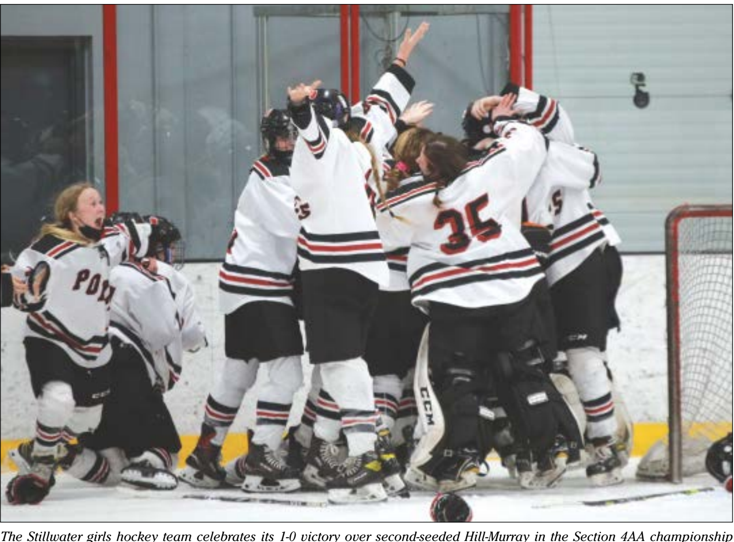
game on Saturday, March 20 at the St. Croix Valley Rec Center. The victory qualifies the Ponies for their first state tournament since 2009.