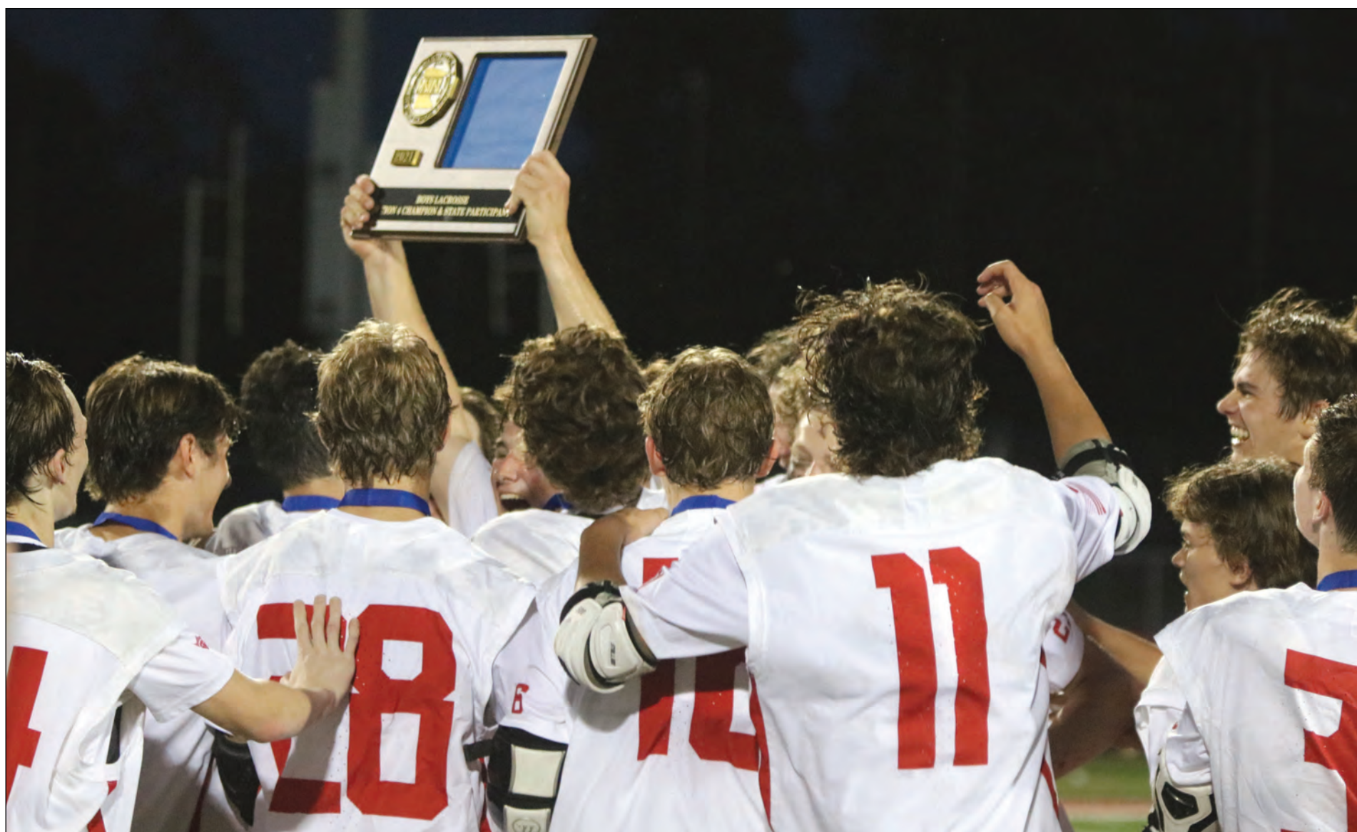
The Stillwater boys lacrosse team celebrates its first-ever Section 4 championship after upending Mahtomedi 14-5 in the finals on Wednesday, June 9 at Stillwater Area High School.