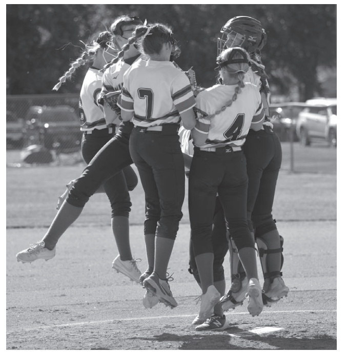
Members of the Jackson County Central softball team get excited during their playoff opener against Windom last Tuesday.