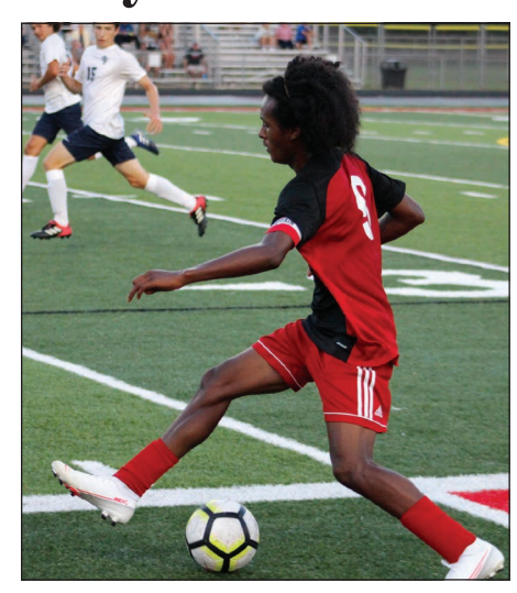
The North Branch boys soccer team opened the season with a scoreless draw against St. Francis, a program that advanced to the state tournament a year ago.