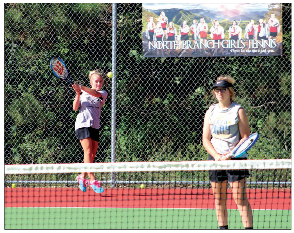
The North Branch girls tennis team returns a number of upperclassmen from last season as the Vikings look to have success in the Mississippi 8 Conference.

Oct. 8, Road Mississippi 8 Championship at Becker, 12:30 p.m.