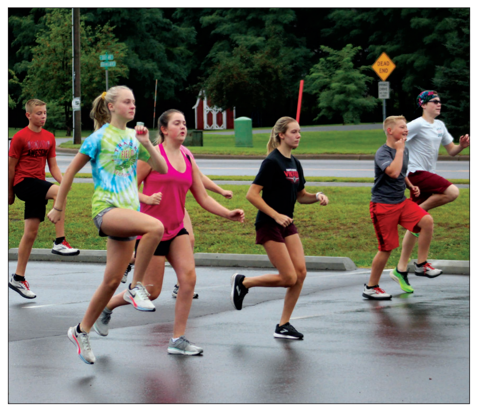
The North Branch cross-country team looks to balance fun and work as they rise in the standings of the

Page 12 Thursday, September 3, 2020 countynewsreview.com