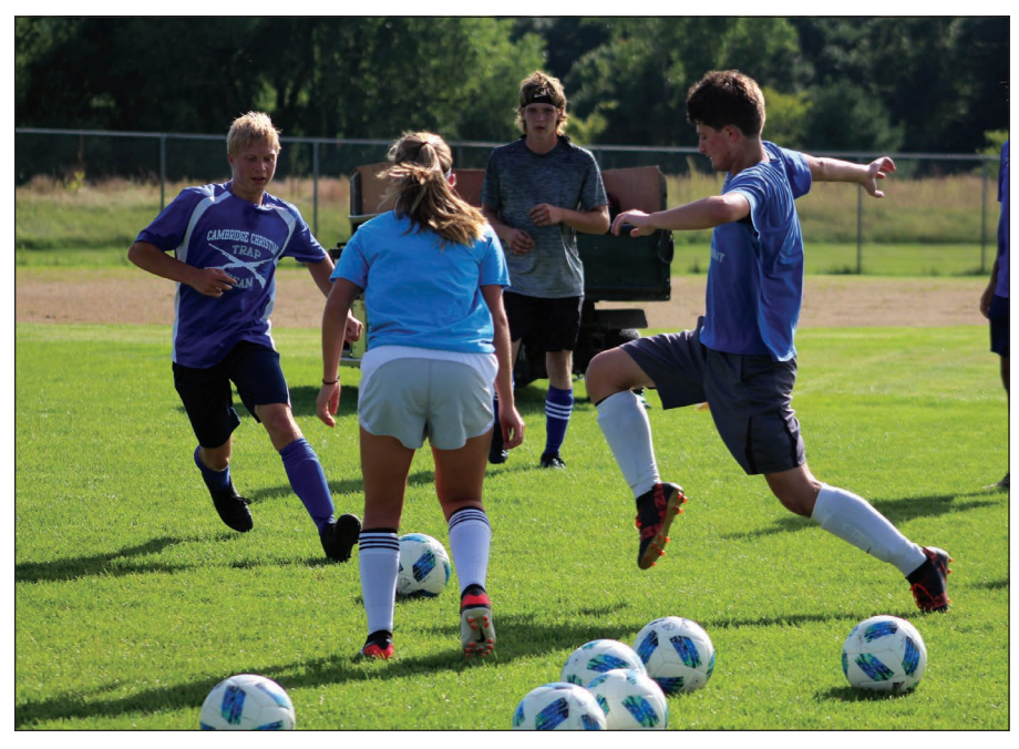
The Cambridge Christian soccer program is an interesting blend of experienced players and newcomers who hope to compete for the Christian Athletic League title.

Oct. 27, 30-31, Christian Athletic League Tournament