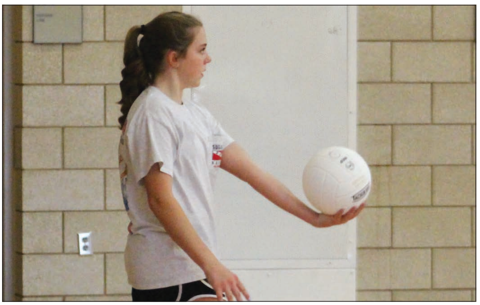
The Cambridge Christian volleyball team hopes its experienced core will help it contend for a Christian

Page 14 Thursday, September 3, 2020 countynewsreview.com