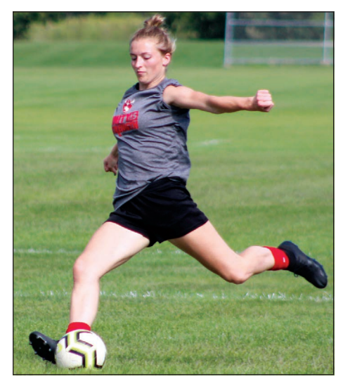
The North Branch girls soccer team expects to reap the benefits of the experience the Vikings have gained from past seasons.

"There are a fair number of newcomers looking to fill out our back line,"