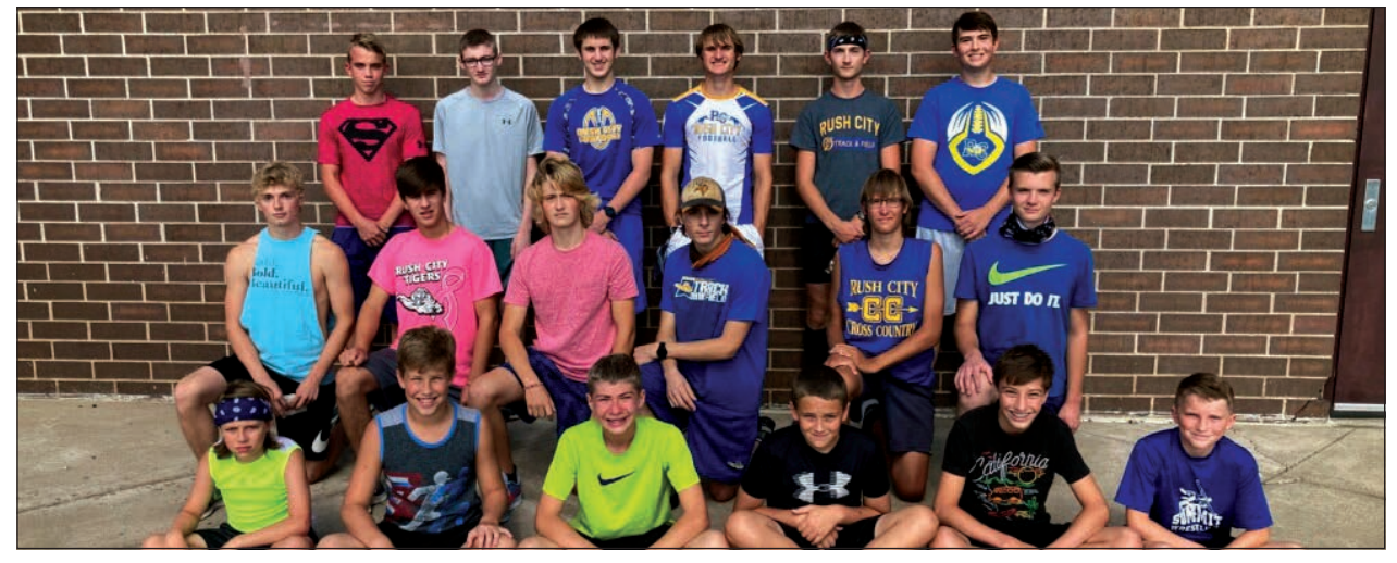
While Rush City lost a number of top runners from last season, the Tigers expect to be competitive again this fall.