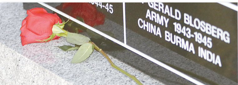
A single rose was placed at the base of one of the monuments.