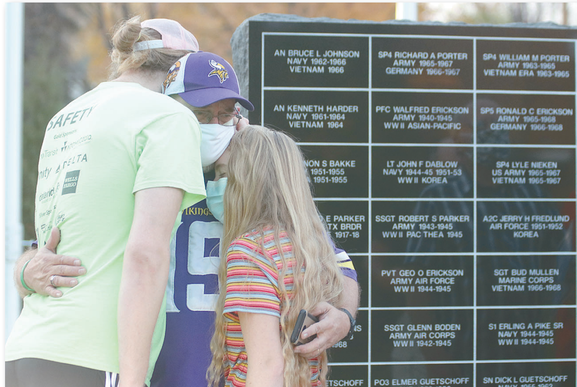
A family embraces after finding a name on one of the walls of the Cambridge Veterans Memorial Park following the dedication ceremony on Friday, Oct. 9. The park is located at 207 Birch Street South, directly across from the historic courthouse building.

"In less than four months, this site transformed from an empty, grassy lot to what you see today," Rostberg opened the ceremony saying. "A lot of