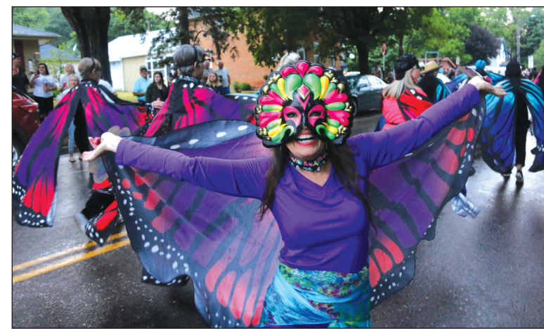
A flock of brightly-colored butterflies were spotted flitting around town during the Saturday night Owl Parade, spreading cheer to