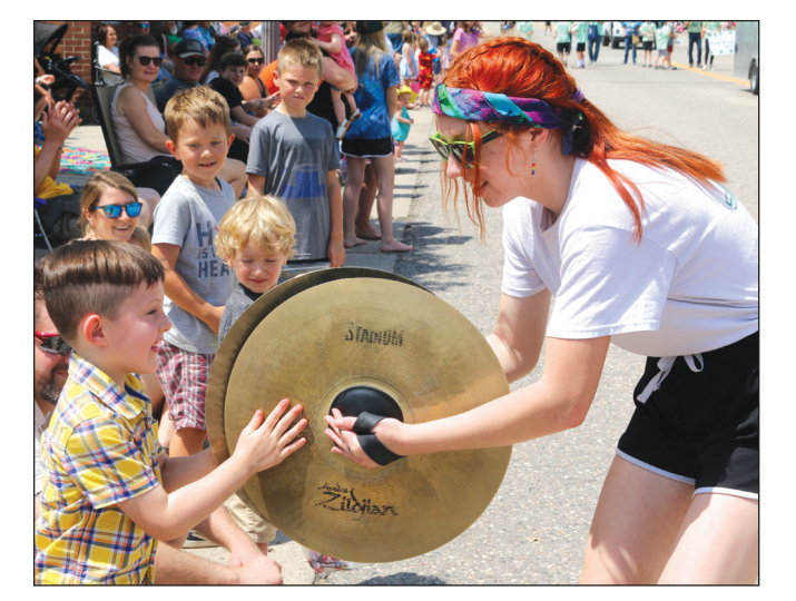
A member of the SuFuDu Drumline lets a young boy clap the cymbals together in between performances in the Grand Parade.