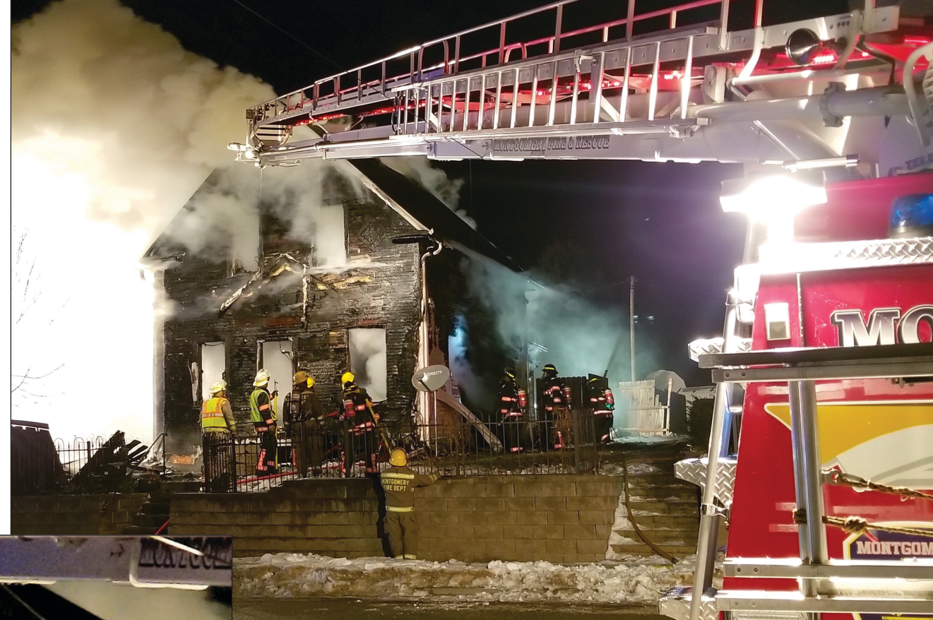
Montgomery and New Prague firefighters work to put out a fire early Wednesday morning, January 6 at 201 Boulevard Ave. NE in Montgomery.

"Firefighters had to fight the fire mainly from the outside of the structure due to the