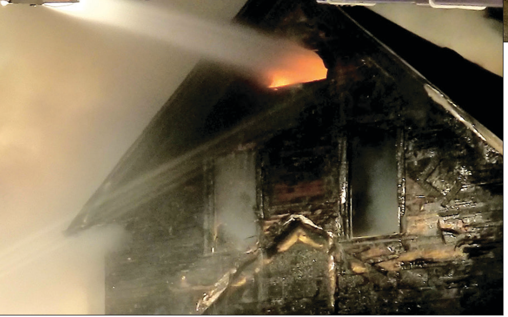
A jet of water blasts from the Montgomery Fire Department's ladder truck at a fire at 201 Boulevard Ave. NE in Montgomery last week.