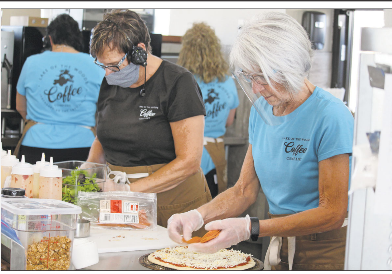
Sydney Mook / Grand Forks Herald

"I think the businesses in town have really done a good job of flexing and flowing after the initial shock of being shut down," Hoffer said. "I think the majority of the businesses are like, 'OK, we're going to have to be creative here and think of ways.' "