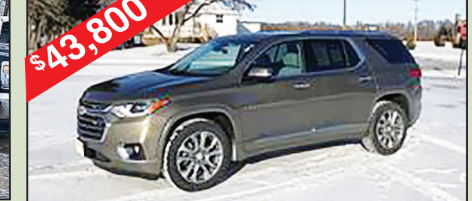
'20 Chevy Traverse Premier with 2nd row buckets, heated & Cooled Leather, Power Liftgate and 23,000 miles on this Stone Gray AWD #20184