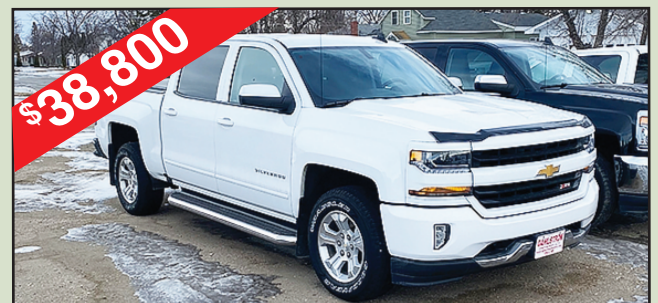
'18 Chevy Silverado LT with Heated Cloth seating, on this local one-owner trade with only 19,000 miles on this White 4WD #18178

Come Experience the Dahlstrom Difference! CHECK OUT THESE & LOTS OF OTHER GREAT VEHICLES ON OUR WEBSITE dahlstrommotors.com