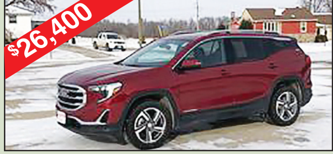
'20 GMC Terrain SLT with Heated Leather, Power Liftgate, Heated Steering Wheel and 23,000 miles on this Red Quartz colored AWD #22765