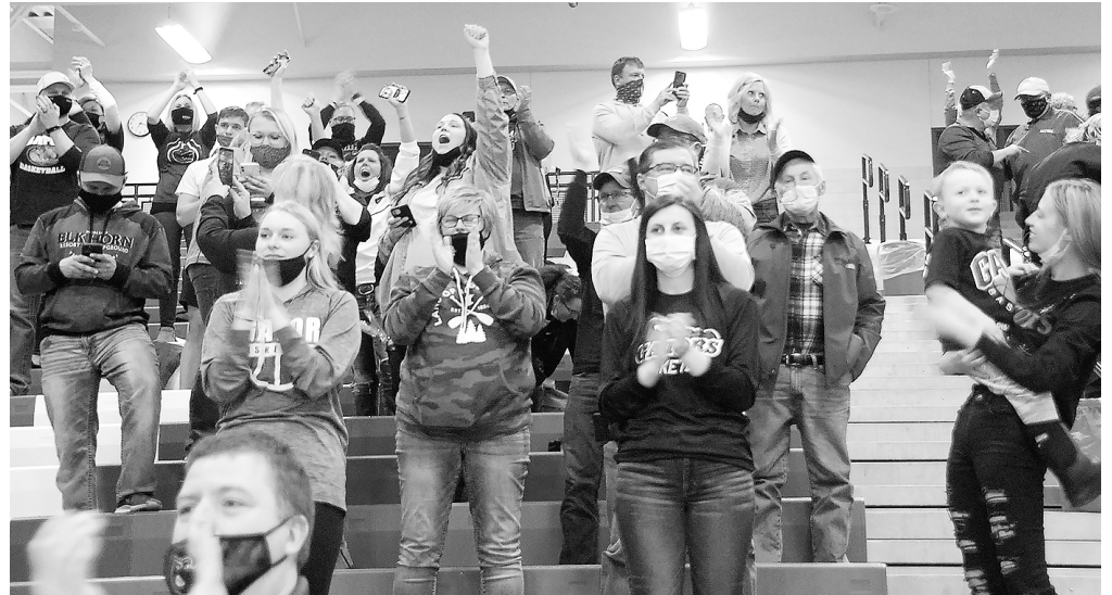
Gator fans rose to their feet and cheered following the Gators' 58-52 state quarterfinal victory over the Deer River Warriors on March 31 in Pequot Lakes.

After the final buzzer sounded, the Gator players celebrated in another huddle and came to the other side of the court to celebrate closer to the fans. The Gators shared a longer moment of celebration with the fans when the players