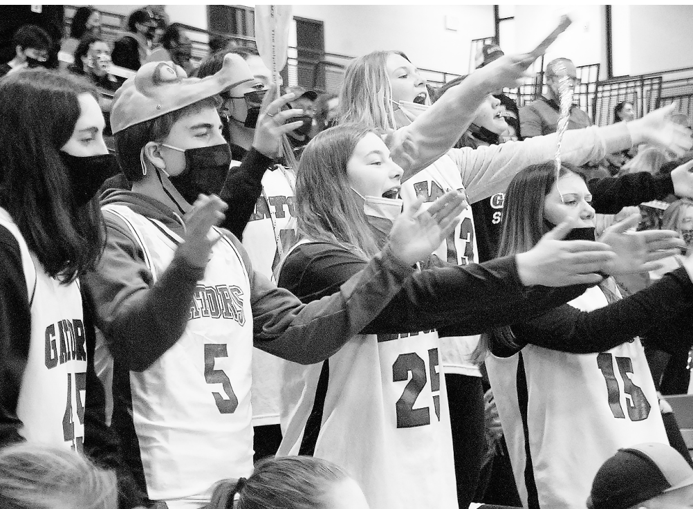
Gator students do a cheer during a timeout at the Gators' 58-52 state quarterfinal victory over the Deer Warriors on March 31 in Pequot Lakes.

Gators a 52-49 lead with 3:32 remaining.