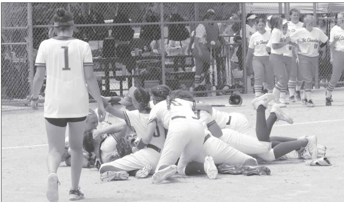
The Giants pile on after winning the Class AA State Softball Championship.