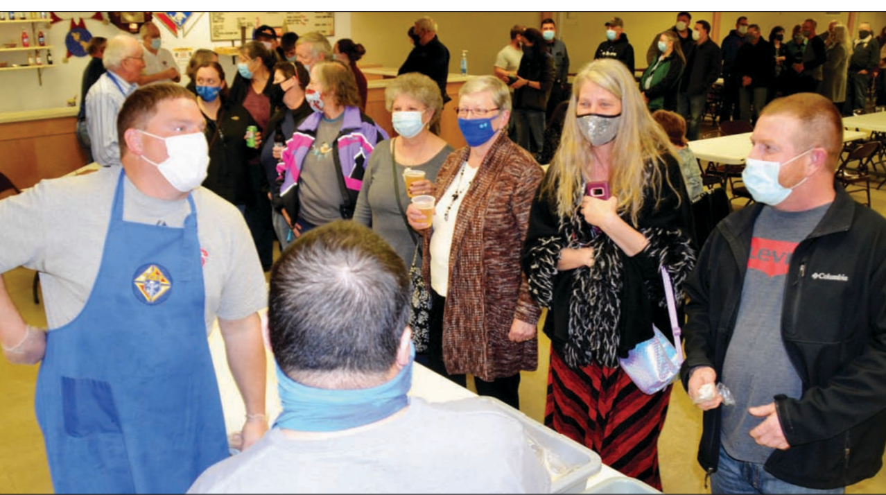
The New Prague Knights of Columbus held their first all take out fish fry on Friday, March 5, at the Knights of Columbus Hall. The Knights of Columbus served 385 meals. There was such a high demand that people sometimes had to wait for their meals. While all the meals were take out, 80 people decided to have them at the KC Hall.