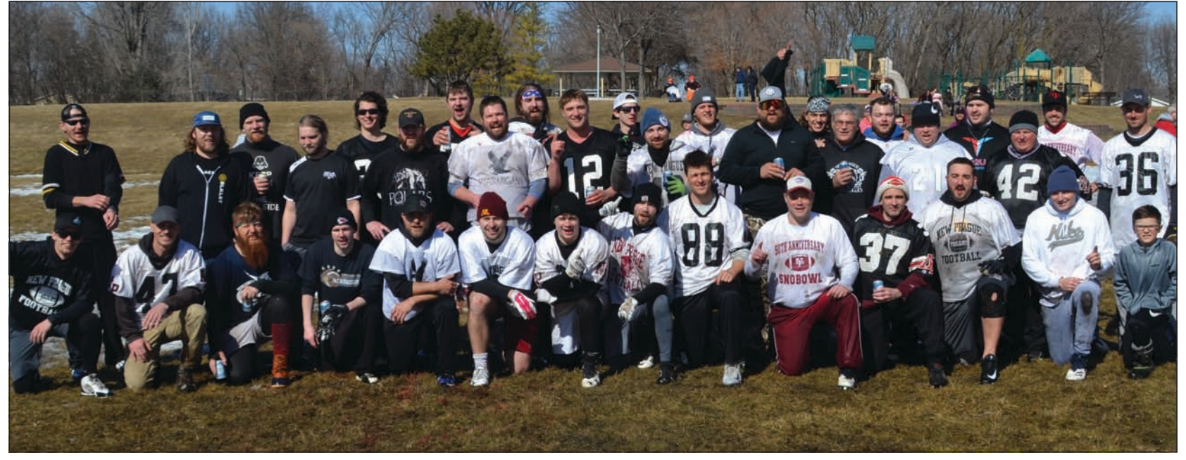
The SnoBowl teams of the Polars and the Ptarmigans gather after the 61st SnoBowl. The annual football game is played by New Prague High School