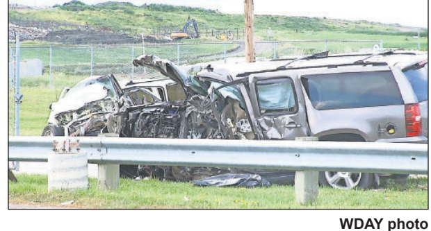
The aftermath of a crash on Seventh Avenue North in Fargo on July 31.

And while business interests in North Dakota have argued that the court's decision could rock the oil industry in an already difficult year, Native American and environmental activists argue that the stalled production in the Bakken