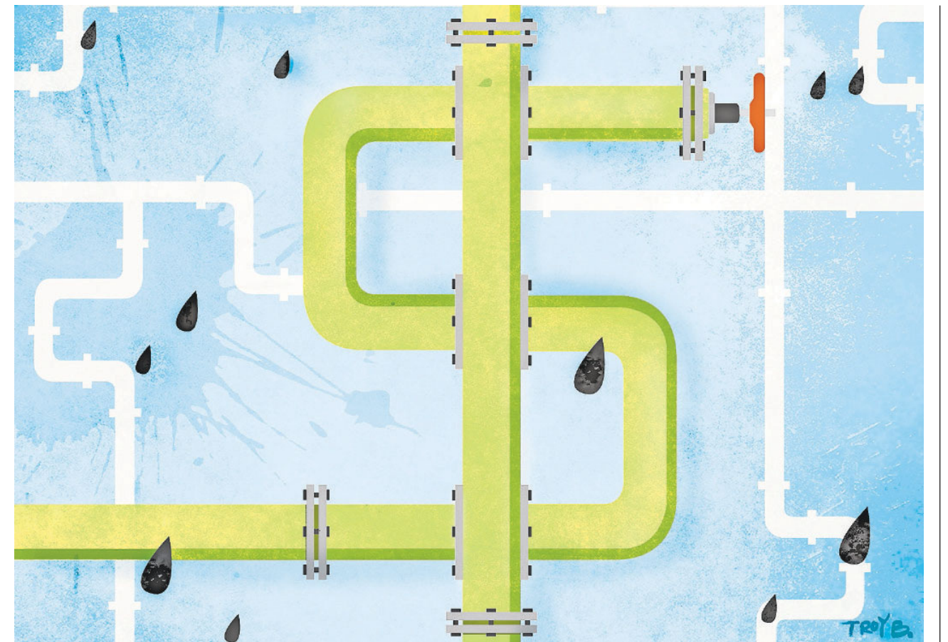
Illustration by Troy Becker