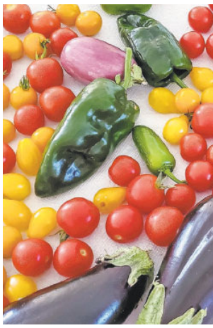
LIFE: Maximize your garden harvest with these recipes. PAGE B1