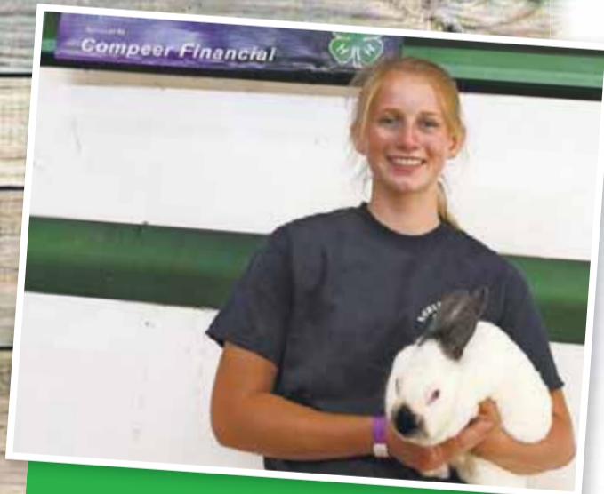
Faith White, grand champion rabbit, dog poster and indoor gardening.