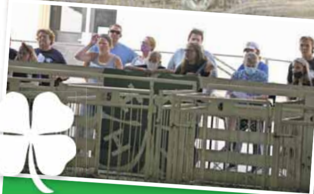
Family members watch Friday morning as their children compete in the Nobles County Achievement Days 4-H Swine show.