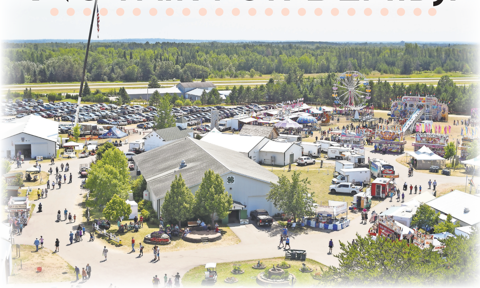
The cancellation of the Beltrami County Fair was announced on Tuesday due to the continued threat of the coronavirus pandemic.