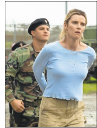
Universal Pictures Betty Gilpin stars in "The Hunt," which Universal Pictures will release in March, seven months after shelving the film.