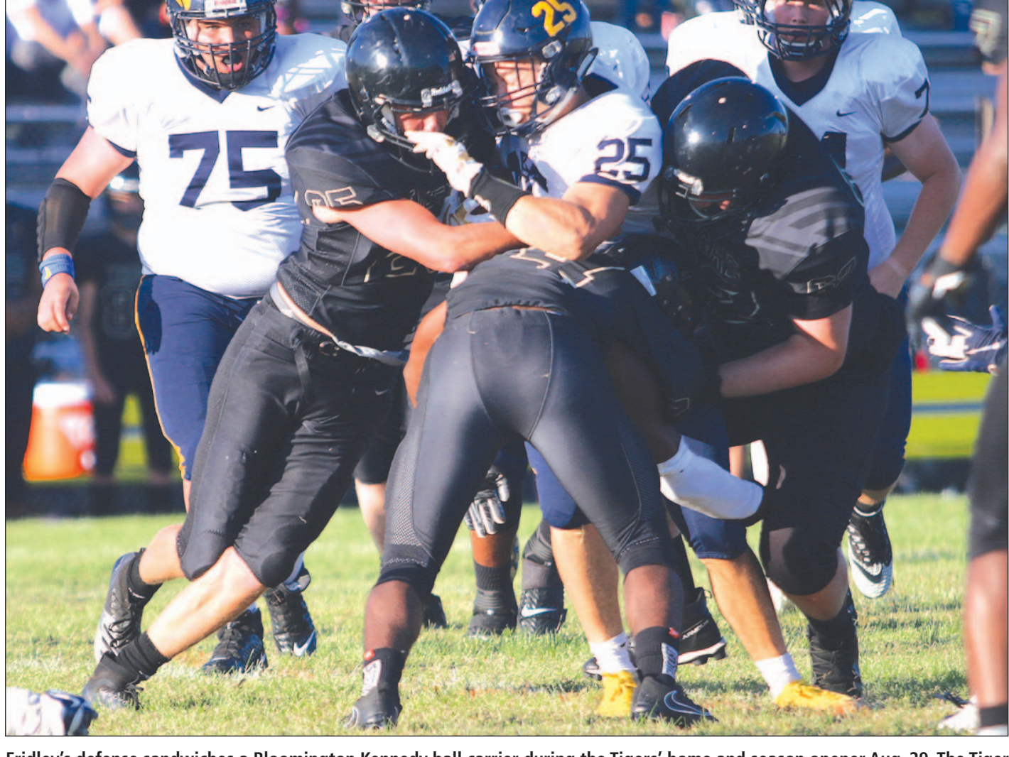
Fridley's defense sandwiches a Bloomington Kennedy ball carrier during the Tigers' home and season opener Aug. 29. The Tiger defense put together a shutout as Fridley powered to a 41-0 victory.