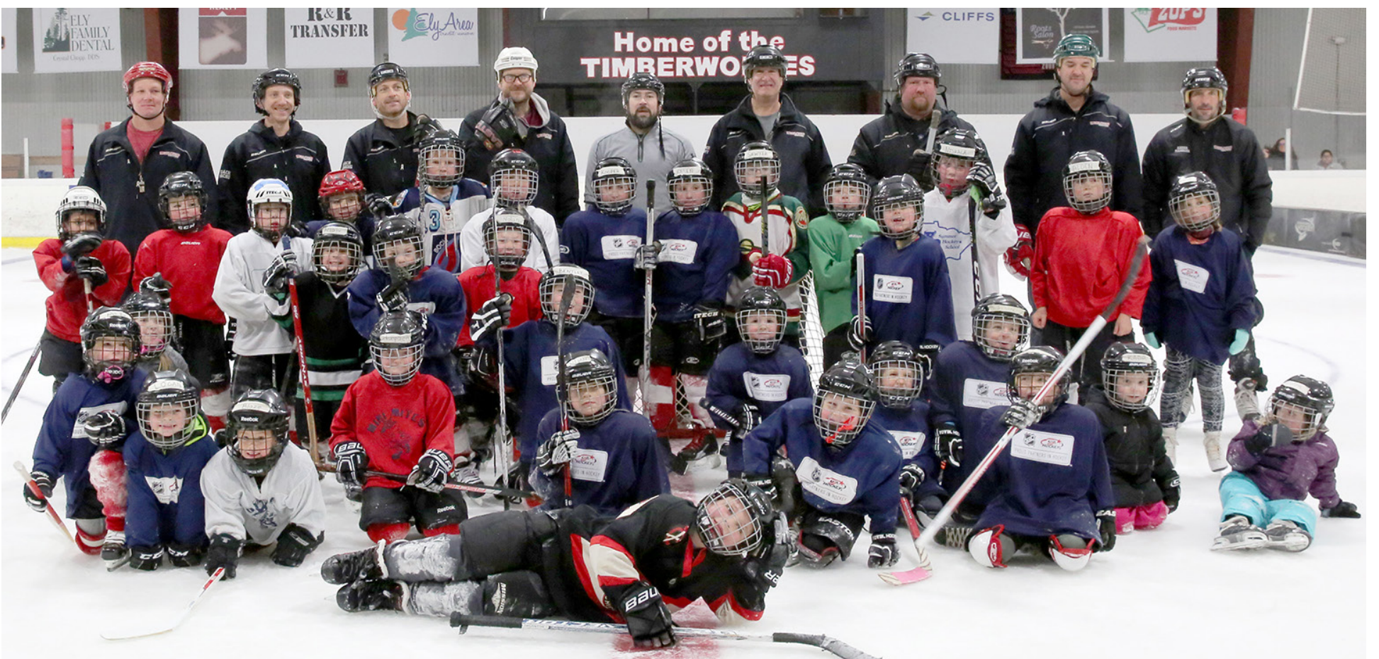
HELD ANNUALLY at the Ely Ice Arena is the Try Hockey for Free day where kids get a chance to lace up the skates and hit the ice.