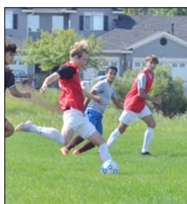
HIGH SCHOOL BOYS SOCCER Northfield boys soccer aiming for Big 9 title. 2B