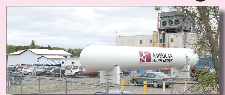
The Long Prairie Packing Plant (part of American Foods Group) had two tents set up on Thursday and Friday, May 21 and 22, in the parking lot for COVID-19 testing that was taking place at the plant in cooperation with Lakewood Health System and Todd County Health and Human Services.