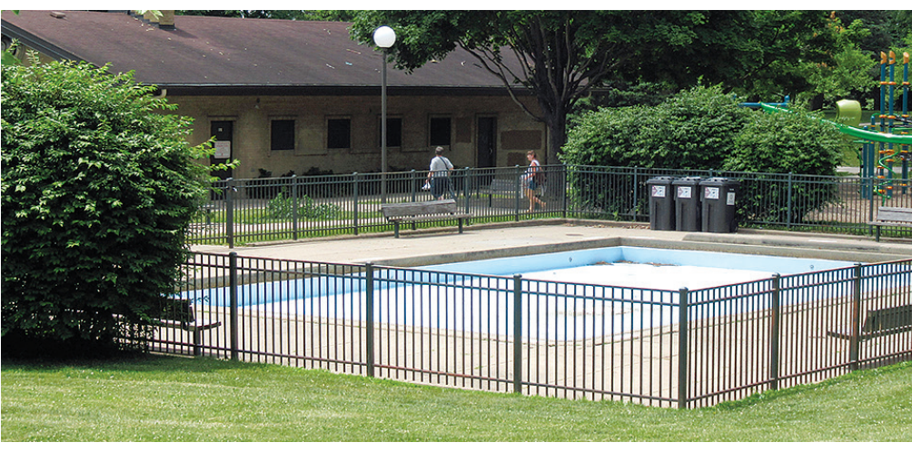
Top left: Red tailed hawk spotted in St. Anthony East. Lower right: Sunset over Church of All Saints and St. Michael's and St. George's Ukrainian Orthodox Church. Top middle: Sunset 9 p.m. along Main Street. Bus on Central Avenue. There's no swimming at Windom Park or any other Minneapolis park, due to concerns about spreading COVID-19. Cover: Bee and flower.