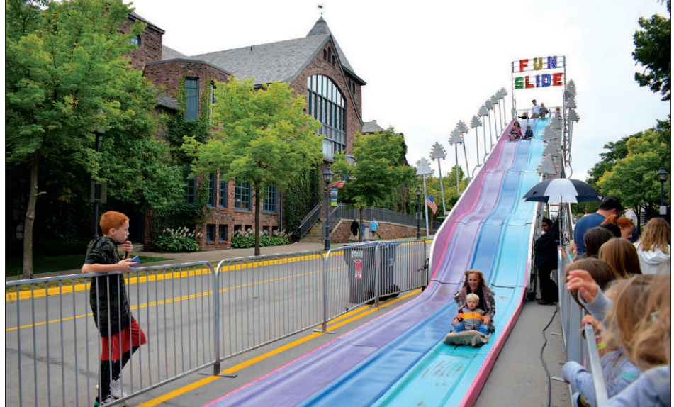
LEFT: Cocoa Bean the dachshund wore a sailor outfit for this year's dog costume contest at Wayzata's James J. Hill Days festival. RIGHT: Families take turns on a giant slide set up on the west end of Lake Street. The 45th annual James J. Hill Days drew many visitors to downtown Wayzata. The weekend-long festival Sept. 6-8 was presented by the Greater Wayzata Area Chamber of Commerce and featured many favorites like dachshund races, a fireworks show over Wayzata Bay, a parade down Lake Street and carnival rides.