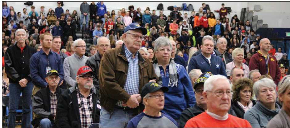
Air Force veterans, and individuals who have a family member who served in the Air Force, stand during an armed forces salute Nov. 11 in the Field House at Blaine High School.