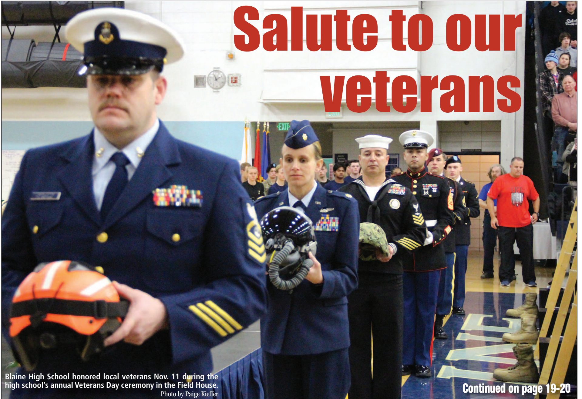
Blaine High School honored local veterans Nov. 11 during the high school's annual Veterans Day ceremony in the Field House.