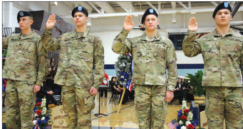
Blaine High School students, who have enlisted in the Army, take a ceremonial oath of enlistment Nov. 11 during a Veterans Day ceremony.