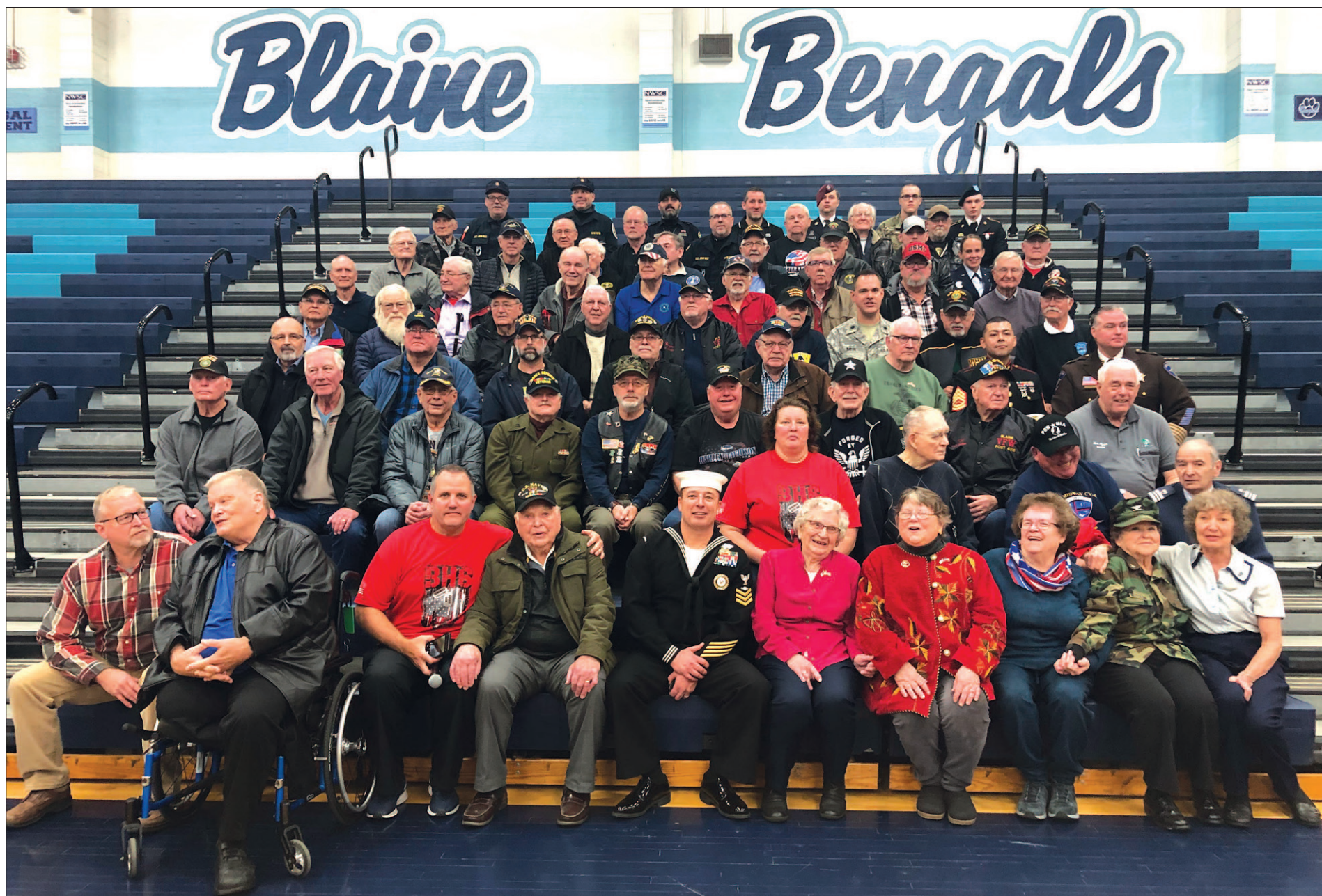
Local veterans pose for a picture Nov. 11 after the annual Blaine High School Veterans Day ceremony in the Field House.