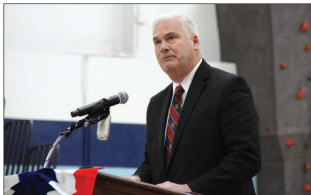
Congressman Tom Emmer speaks at the annual Blaine High School Veterans Day ceremony Nov. 11 in the Field House.

"Across this great country, and throughout the world, Americans will pause this Veterans Day to honor our brave fighting men and women, who