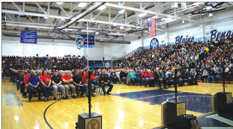
Blaine High School honored local veterans Nov. 11 during the high school's annual Veterans Day ceremony in the Field House.