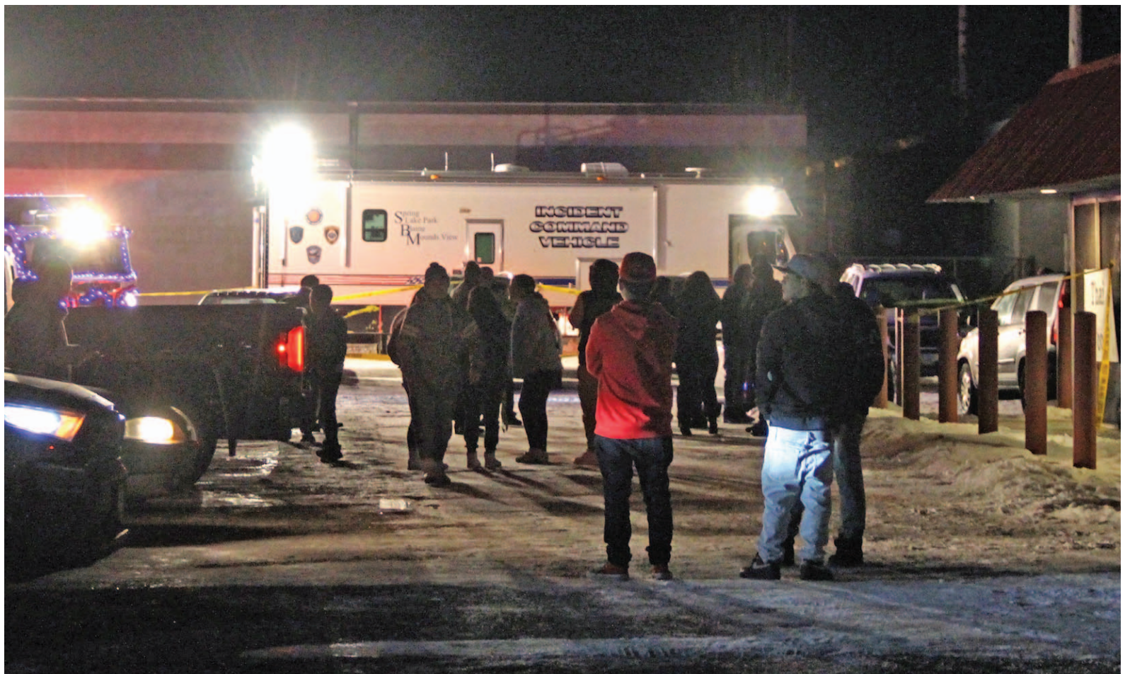
Concertgoers from the Dala Thai Restaurant and Banquet Hall look over the crime scene of a shooting in the parking lot after they are released from the building early Sunday, Dec. 22. The shooting resulted in one 19-year-old male being killed and at least seven others injured.