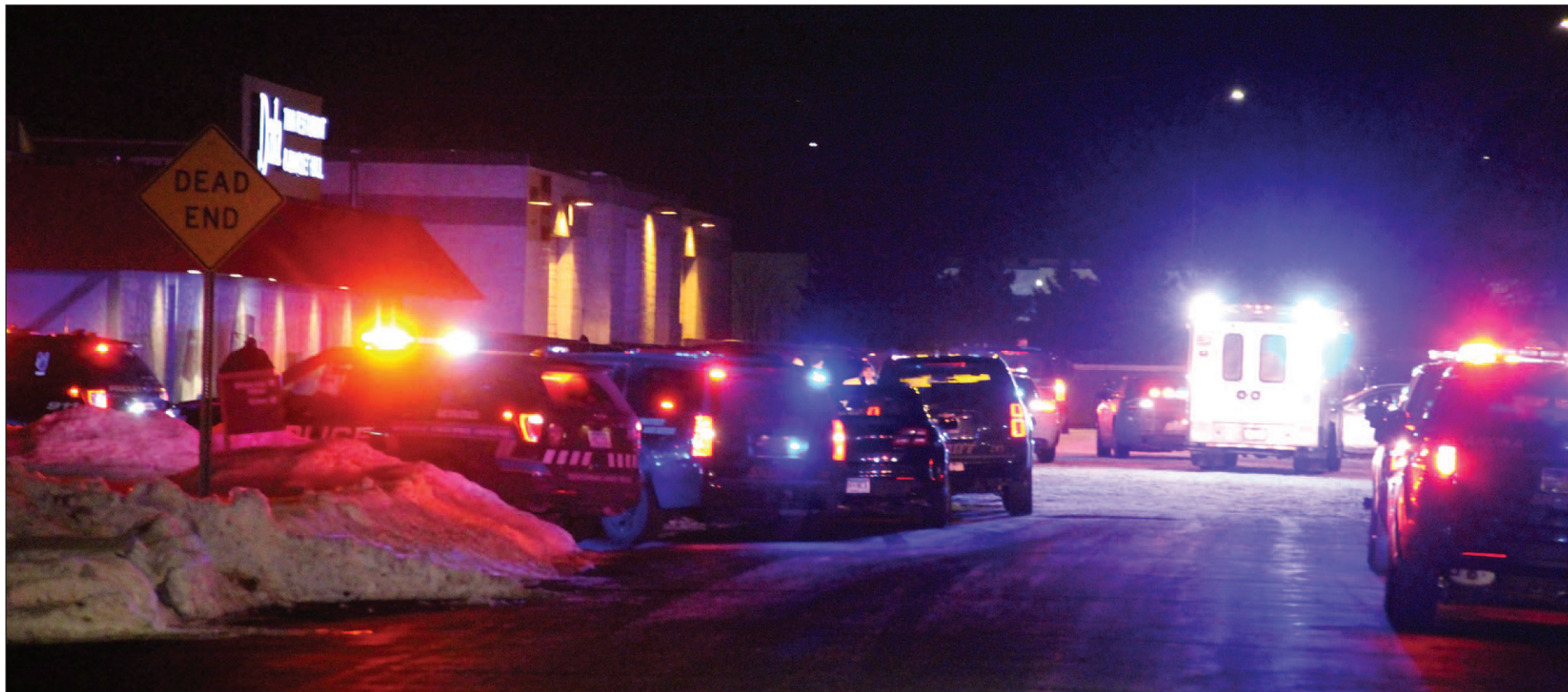
Multiple agencies responded to the scene of a shooting at 12:08 a.m. Sunday, Dec. 22, in the parking lot of the Dala Thai Restaurant and Banquet Hall in Spring Lake Park while a concert was occurring inside. One 19-year-old male was killed in the shooting and at least seven others injured.