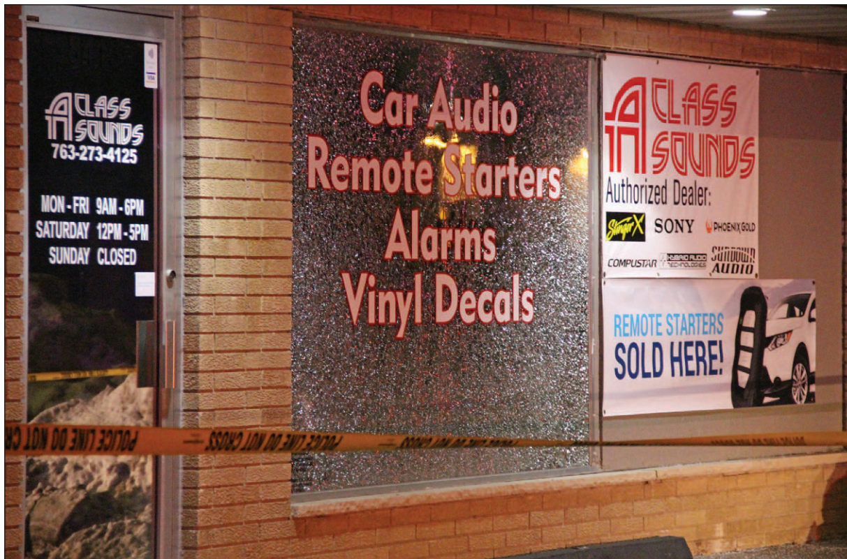
A Class Sounds was damaged when stray gunfire hit the building in Spring Lake during a shooting Sunday, Dec. 22, in the parking lot of the neighboring Dala Thai Restaurant and Banquet Hall.