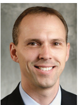
Rep. Rod Hamilton