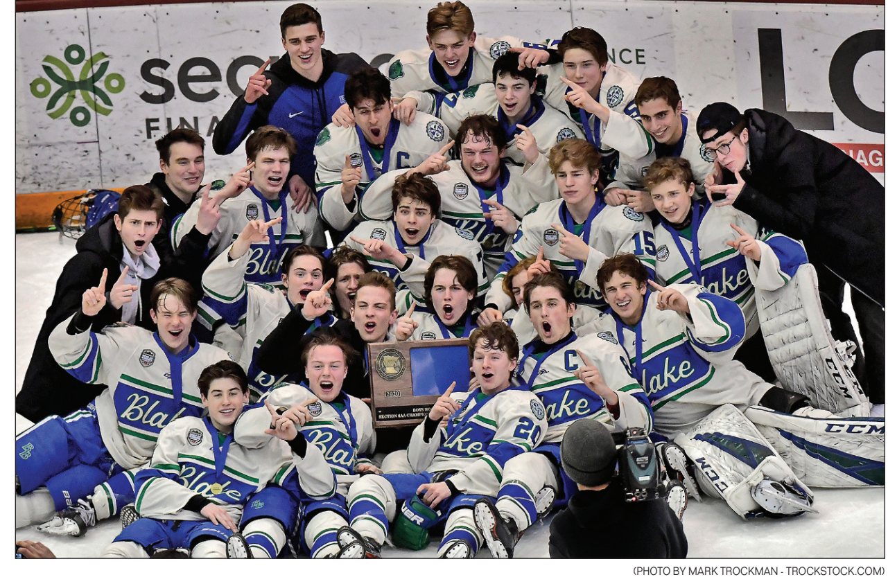
Members of The Blake School's boys hockey team are living the dream, with the Section 6AA championship trophy in hand, after defeating Benilde-St. Margaret's 4-3 in overtime Feb. 26 at Mariucci 3M Arena on the University of Minnesota campus.

Follow the Sun sports writers on Twitter @MNSunSports and on Facebook at facebook.com/Sun-SportsStaff.