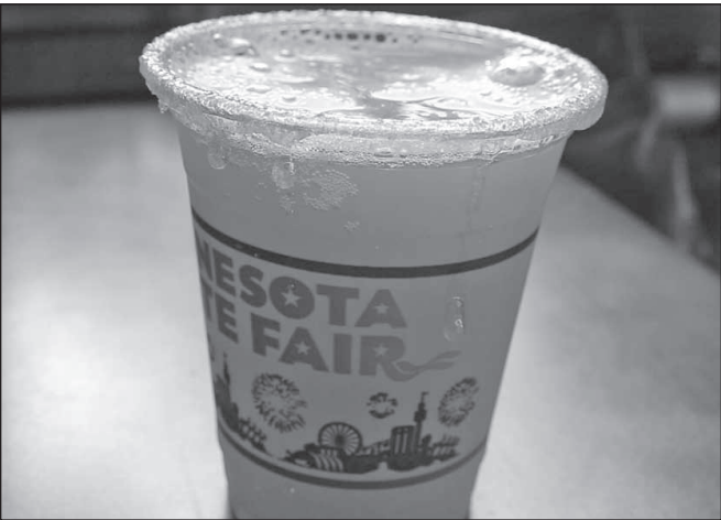
The Cotton Candy Milkshake IPA by Big Woods Brewery, a new exclusive beer at the State Fair.