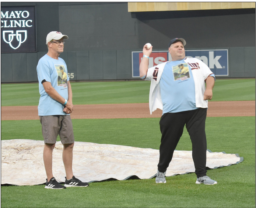
JOHANNA ARMSTRONG | DAILY JOURNAL

Eighteen buses and two vans drove people to the tailgate party, and from the tailgate party to the game, with more supporters meeting the group at the game, adding up to about 1,200 tickets for people supporting Harmon’s Heart of Baseball from all over Minnesota. “It’s amazing seeing all these people coming together to support Harmon’s Heart of Baseball, and really encouraging and cheering for