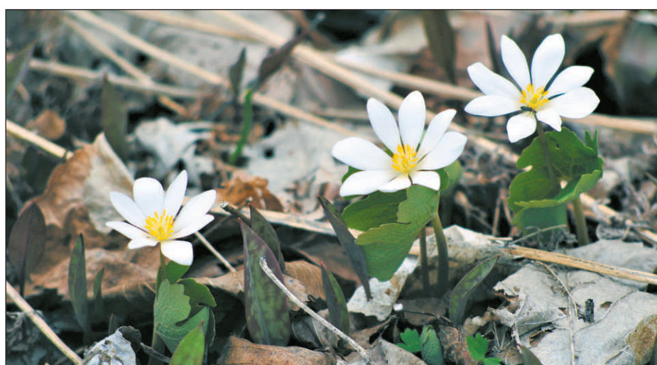
A group of bloodroots bloom on the forest floor on a May day. Note eight white petals and the large leaf.

A little later are the trout-lilies, of either white or yellow, with yellow bellworts nearby. More white is seen in the magnificent and abundant trilliums and the unique flower of Dutchman's breeches. Violets live up to their name with purple flowers, but also some are white and yellow.