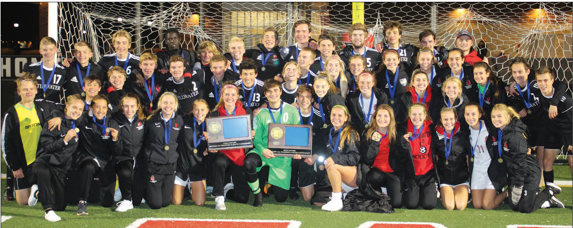
The Stillwater boys' and girls' soccer teams celebrated their Section 4AA championships on Tuesday, Oct. 16 at Stillwater Area High School. The girls returned victorious from East Ridge just as the boys' team finished off its home shoot-out victory over East Ridge. This is the sixth time in school history, but first since 2010, that the teams have each qualified for state in the same season.