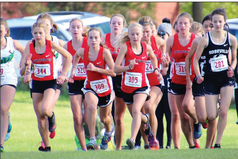
Members of the Stillwater girls' cross country team move out fast during the start of the Suburban East Conference Meet on Tuesday, Oct. 16 at Tanners Brook Golf Club in Forest Lake. The Ponies won their first conference championship since 2000.