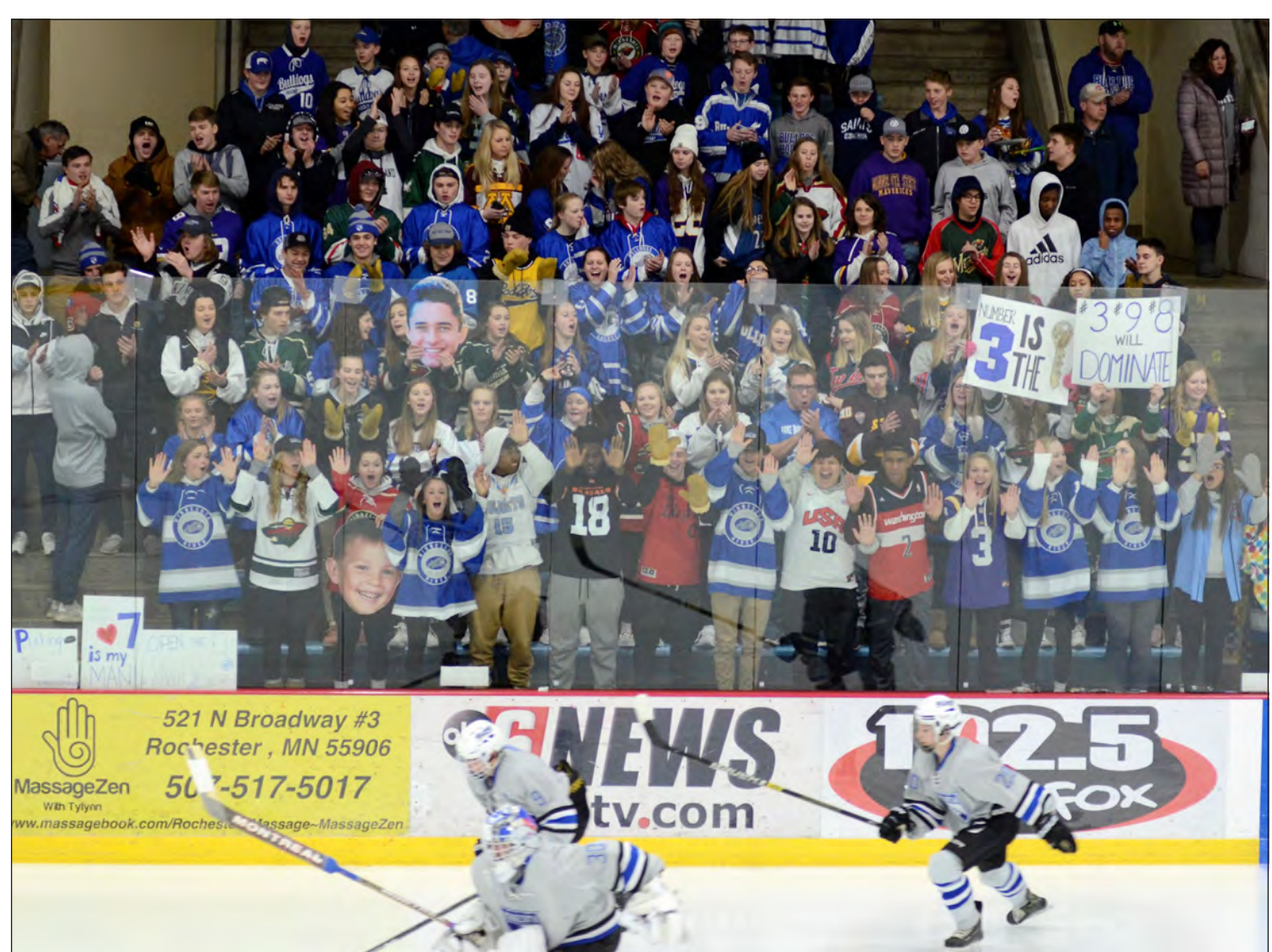
Students cheer as the Bulldogs take the ice.