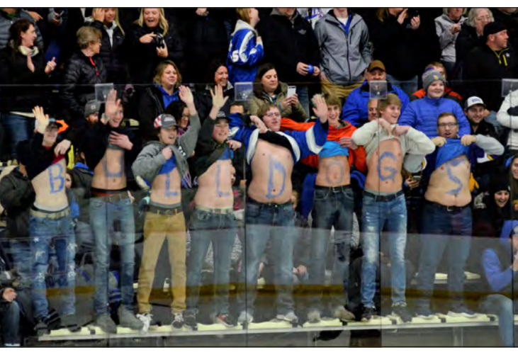
Fans spell out their favorite team.

East Grand Forks became the Section 8A champion with a 3-1 win over Warroad on Thursday night at the Civic Center. The Green Wave,