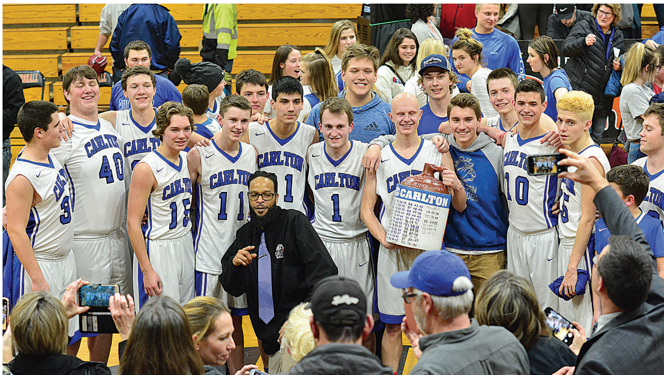
Fans surround the Carlton Bulldogs team for photos after the Bulldogs defeated the Wrenshall Wrens in a last-second shot to win the game.