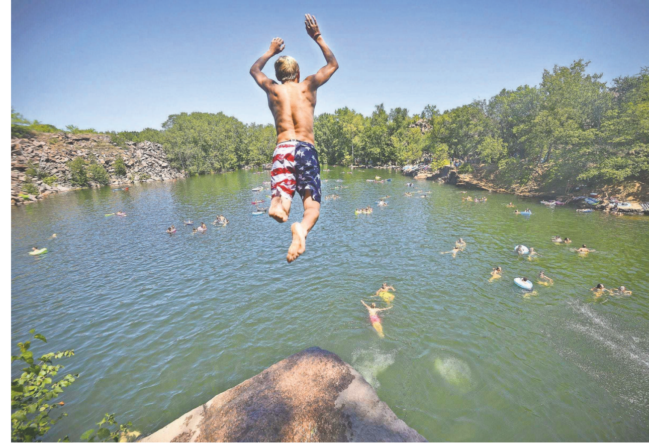
A diver takes flight from a cliff high over the 116-foot-deep water of Quarry 2 in Quarry Park & Nature Preserve in this file photo. USA TODAY NETWORK

Book a night in Red Wing's historic St. James Hotel,