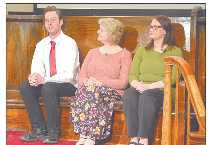
The play, "Marjorie Prime," features a small cast of four local actors and actresses.