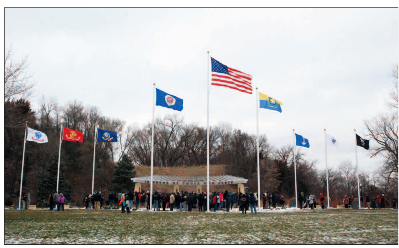
A large crowd gathers for the Veterans Park Dedication Ceremony in Chaska on Nov. 11.