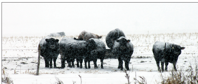
These cows shown (above) south of Pipestone on Tuesday during a light snow may not like the wintry weather conditions anymore than we do, but they do have a natural advantage against the cold-weather elements with natural body temperatures of 102 degrees and their 1-2-inch fur coats.

"This was definitely the coldest we've seen for probably 10-20 years," Gillispie said. "You have a whole generation