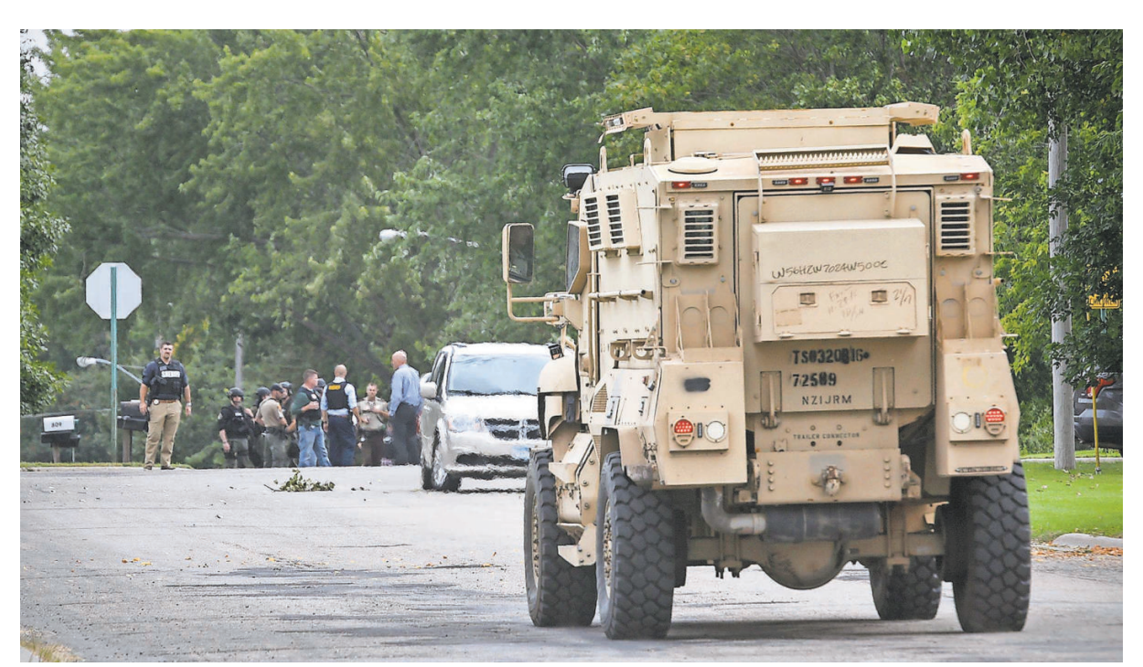
An armored vehicle approaches the scene where a Stearns County deputy was shot with an arrow Thursday in Sauk Centre. A suspect was taken into custody after a two-hour standoff.