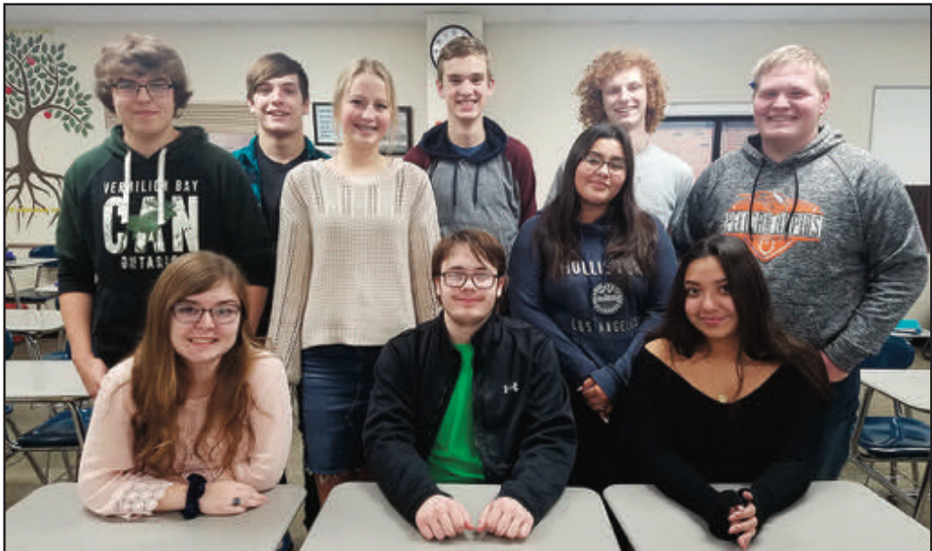
Students involved in the Pelican Rapids High School mass communications class: