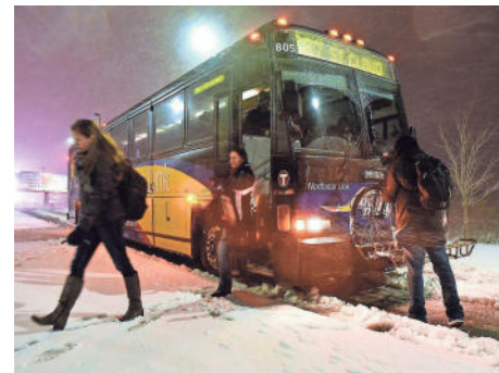
The North Star Link bus line was supposed to be a pilot project to build ridership for an eventual extension of the Northstar rail service to St. Cloud.

Nora G. Hertel: 320-255-8746, nhermel@stcloudtimes.com and on Twitter @nghertel.