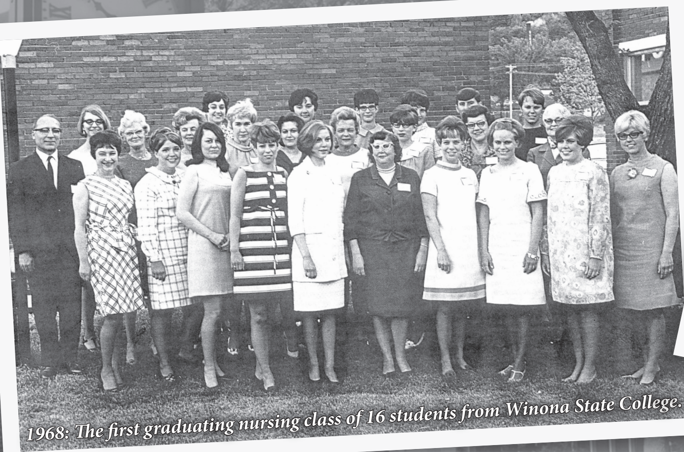
1968: The first graduating nursing class of 16 students from Winona State College.

CONGRATULATIONS WINONA HEALTH ON 125 YEARS!