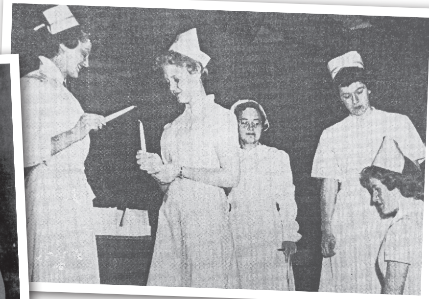
■ Student nurses receive their caps at the first capping ceremony in 1954.

community came together to meet that need, raising $4,500 to renovate the Langley Home into an 18-room hospital. A year later, the Winona General Hospital Training School was founded. That first year, the hospital served 225 patients with a staff